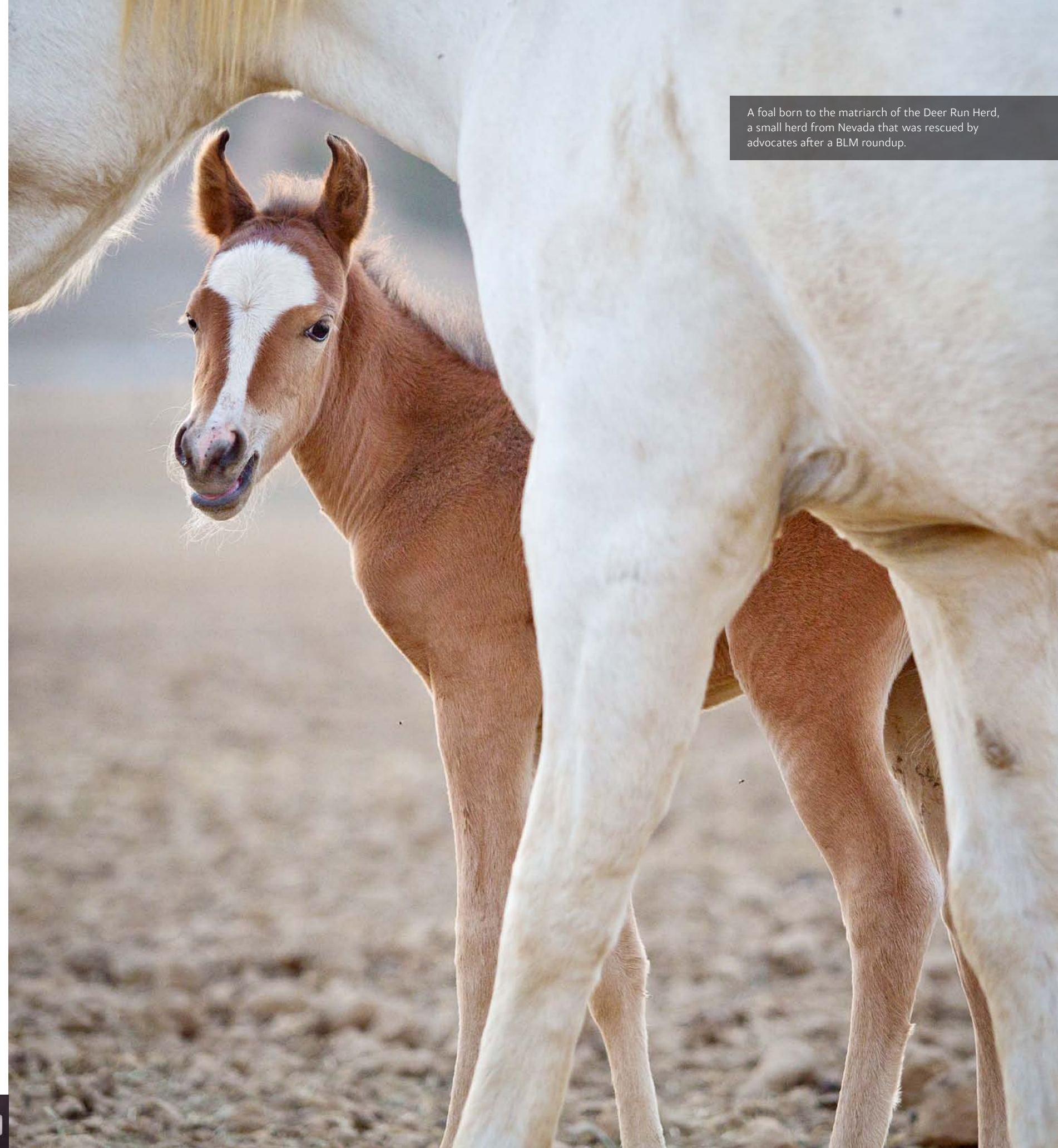
A foal born to the matriarch of the Deer Run Herd, a small herd from Nevada that was rescued by advocates after a BLM roundup.