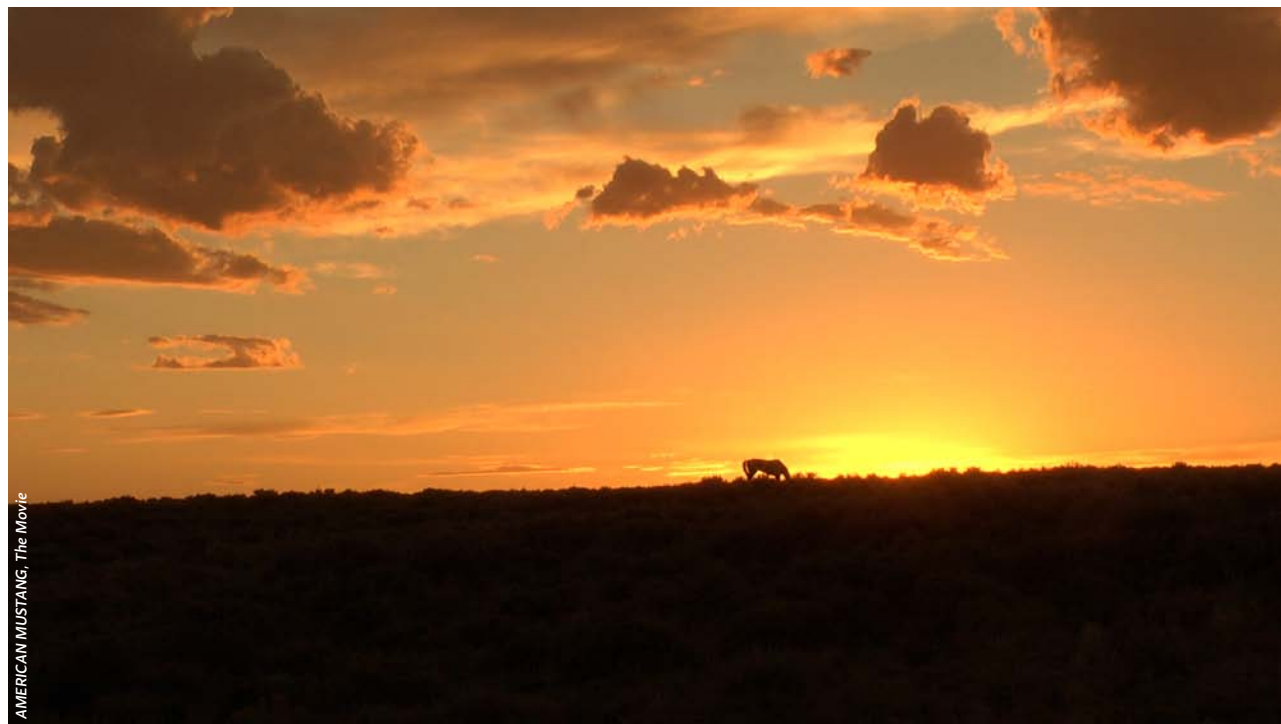
This beautiful image from the movie comes with the saddest of stories. The horse pictured was an old, slow moving mustang that had lived his whole life in the wild on the Wyoming range. On the day after this shot was taken, he was rounded up, driven by helicopters over 20 miles into a BLM trap. By the time he got there he was lame, traumatized, and exhausted. The BLM put him down at the trap site.

HC That's a very interesting point. Ranchers tend to be conservative politically, so it is completely backward that they