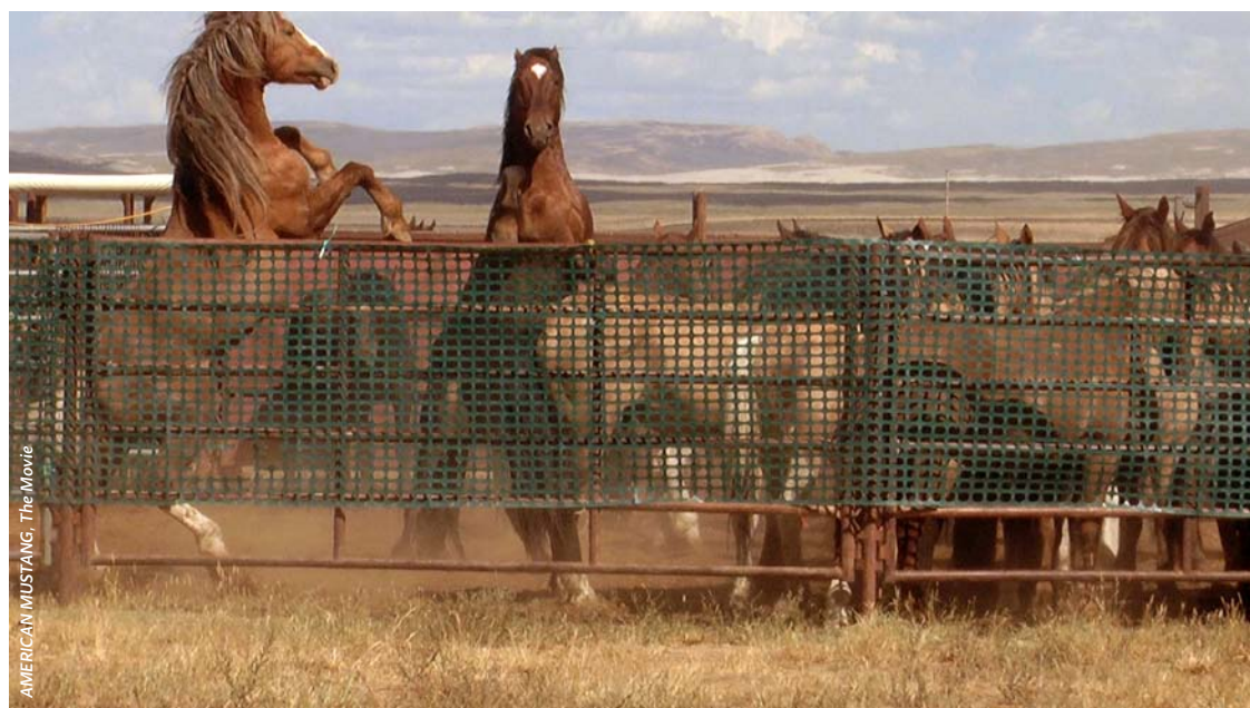
Stallions fight after being forced into cramped quarters at a BLM trap. Many wild horses are seriously injured in the government roundups and during the processing that begins as soon as they are removed from the range.

EPP Yes, today wild horses are restricted to just 11% of BLM lands. Yet even on that small amount