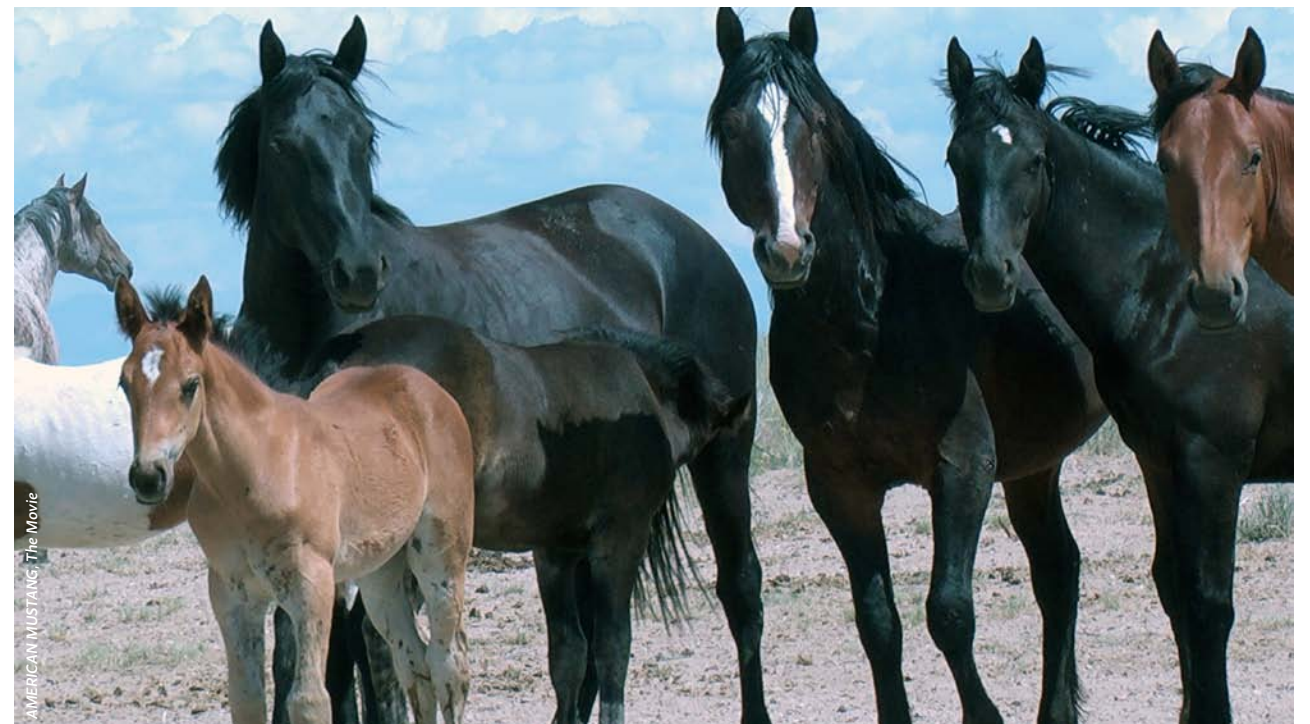
Just days before these wild horses were rounded up and removed from the Wyoming range, AMERICAN MUSTANG, the movie, documented the horses with their family bands. The White Mountain Herd, Rock Springs Wyoming, July 2010