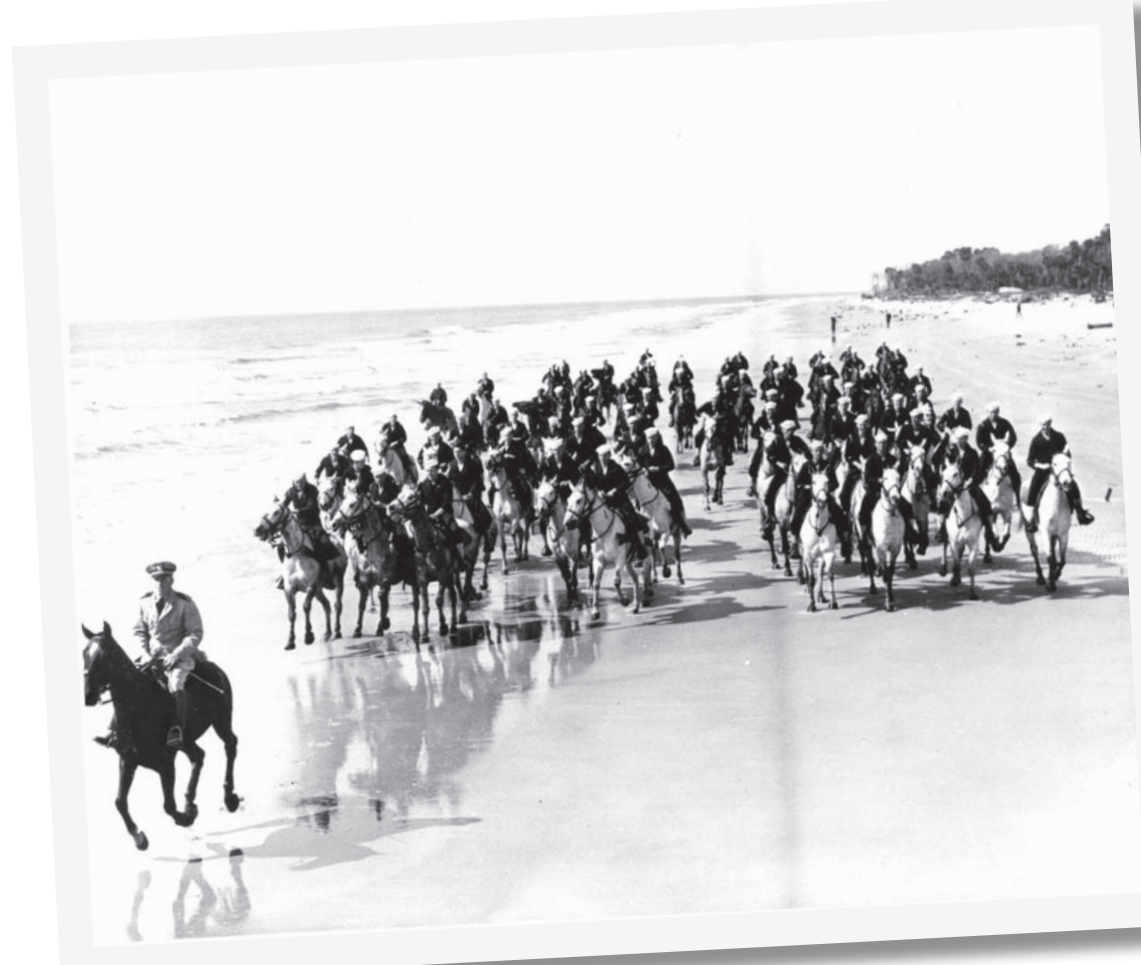
Riders from the Mounted Beach Patrol and Dog Training Center, at Hilton Head, S.C gallop across the beach. Jockeys, rodeo riders, polo players and stuntmen were among the skilled riders who responded to the Coast Guard's call for experienced equestrians to create the Mounted Beach Patrol.