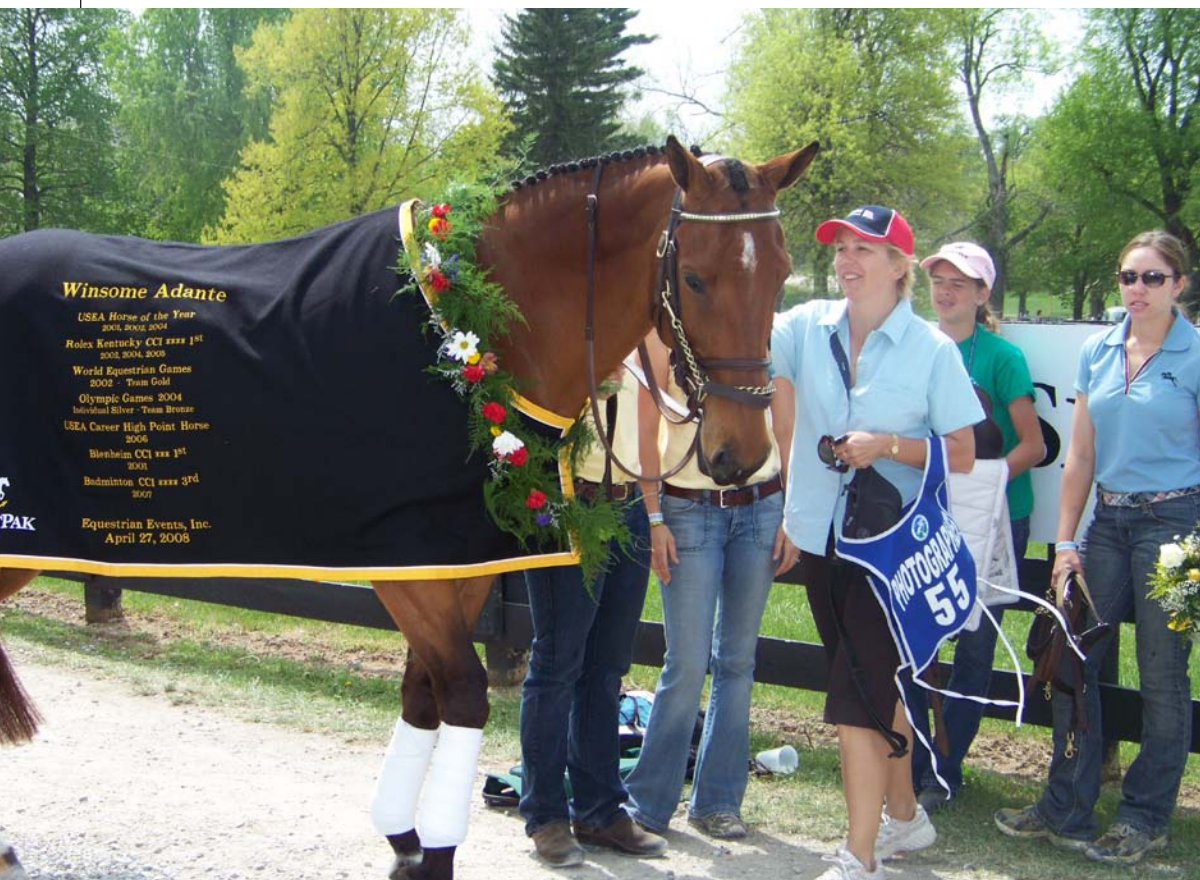
Winsome Adante, aka "Dan," is the most decorated horse in the history of the sport of Eventing.