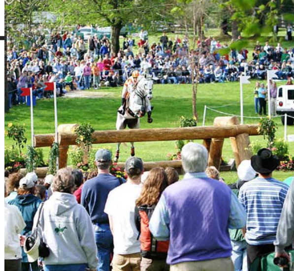
Spectators can experience the action on the cross country up close!

“Rolex Kentucky,” as the nation’s premier Three-Day Event is commonly known, is one of the world’s most prestigious equestrian competitions and features the world’s best horses and riders