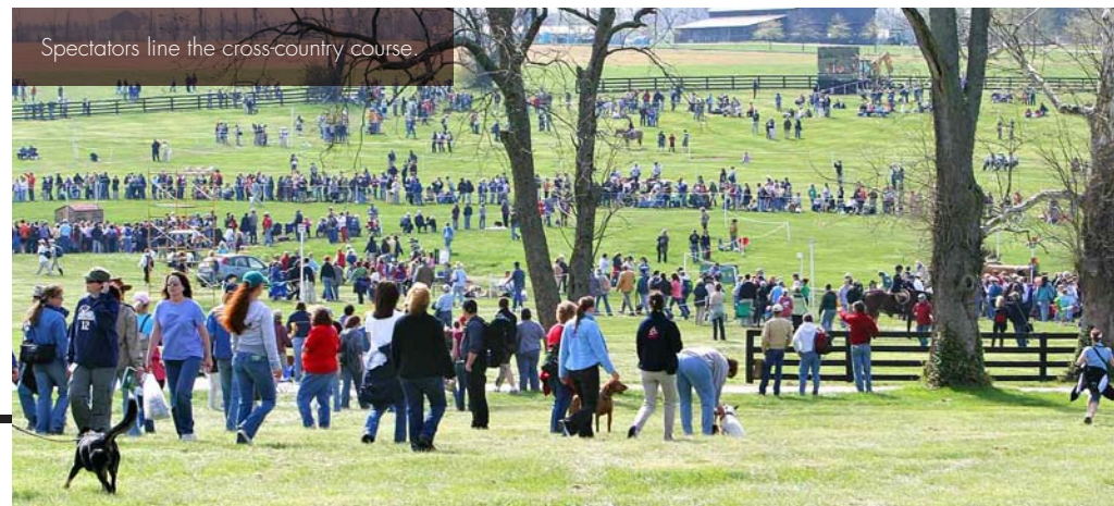
Spectators line the cross-country course.

From the Cincinnati airport, it's just over an hour and a pretty straight shot south on good roads, for the most part. If you are traveling with friends, you'll need a car to get back and forth from your hotel to the horse park anyhow, so the rental car costs can be shared among your group.