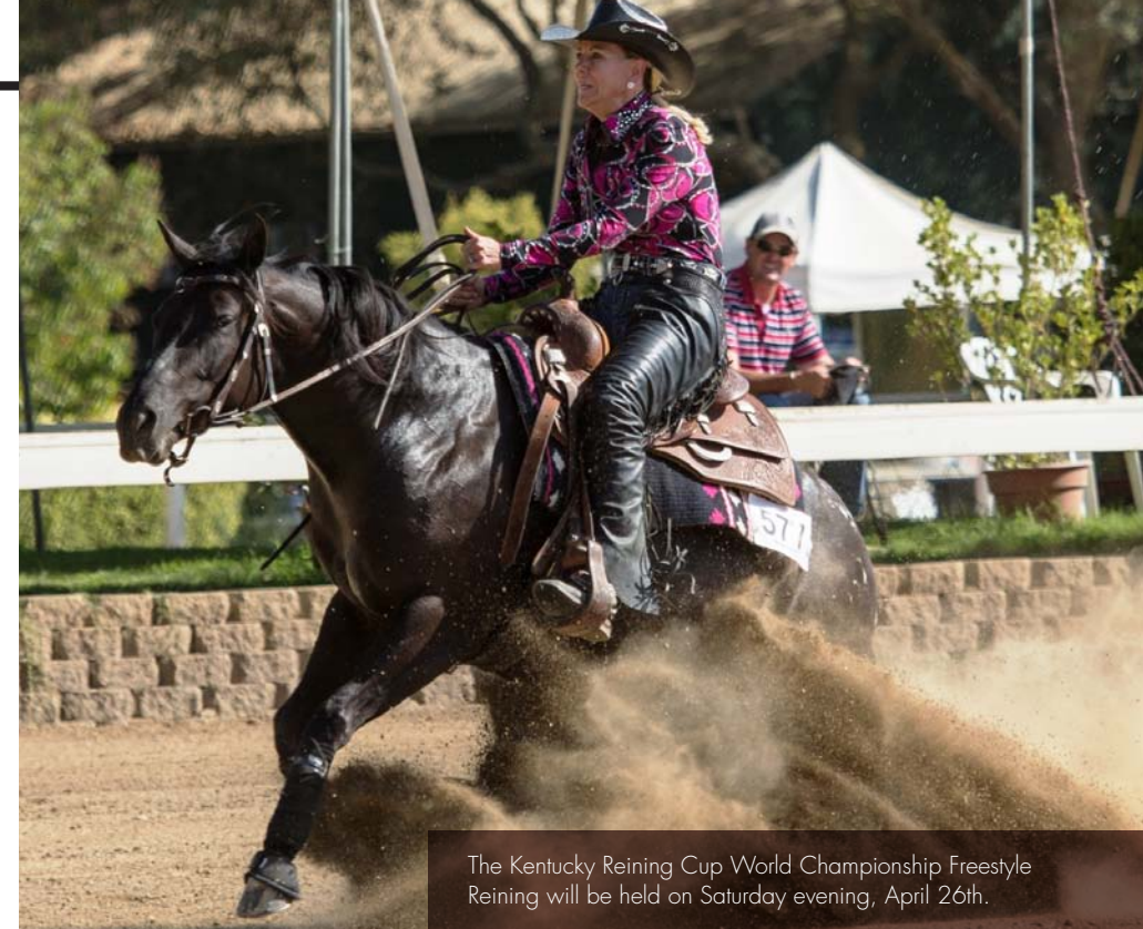
The Kentucky Reining Cup World Championship Freestyle Reining will be held on Saturday evening, April 26th.

Hospitality packages that include VIP parking, hospitality tents, and other amenities are available for additional fees ranging from $675.00/person to $1875.00/person. In addition to the RK3DE, the Kentucky Reining Cup World Championship Freestyle Reining