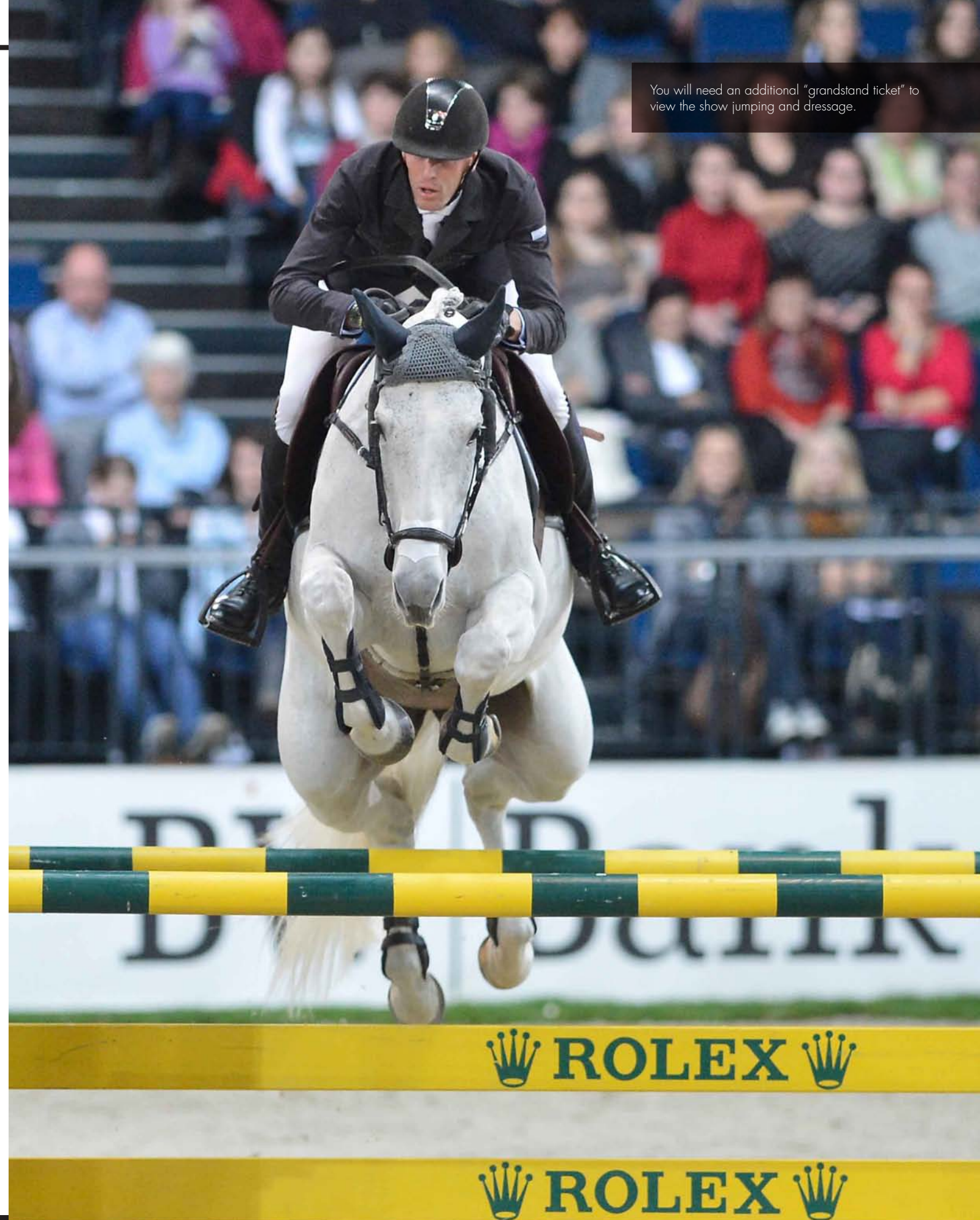
You will need an additional “grandstand ticket” to view the show jumping and dressage.