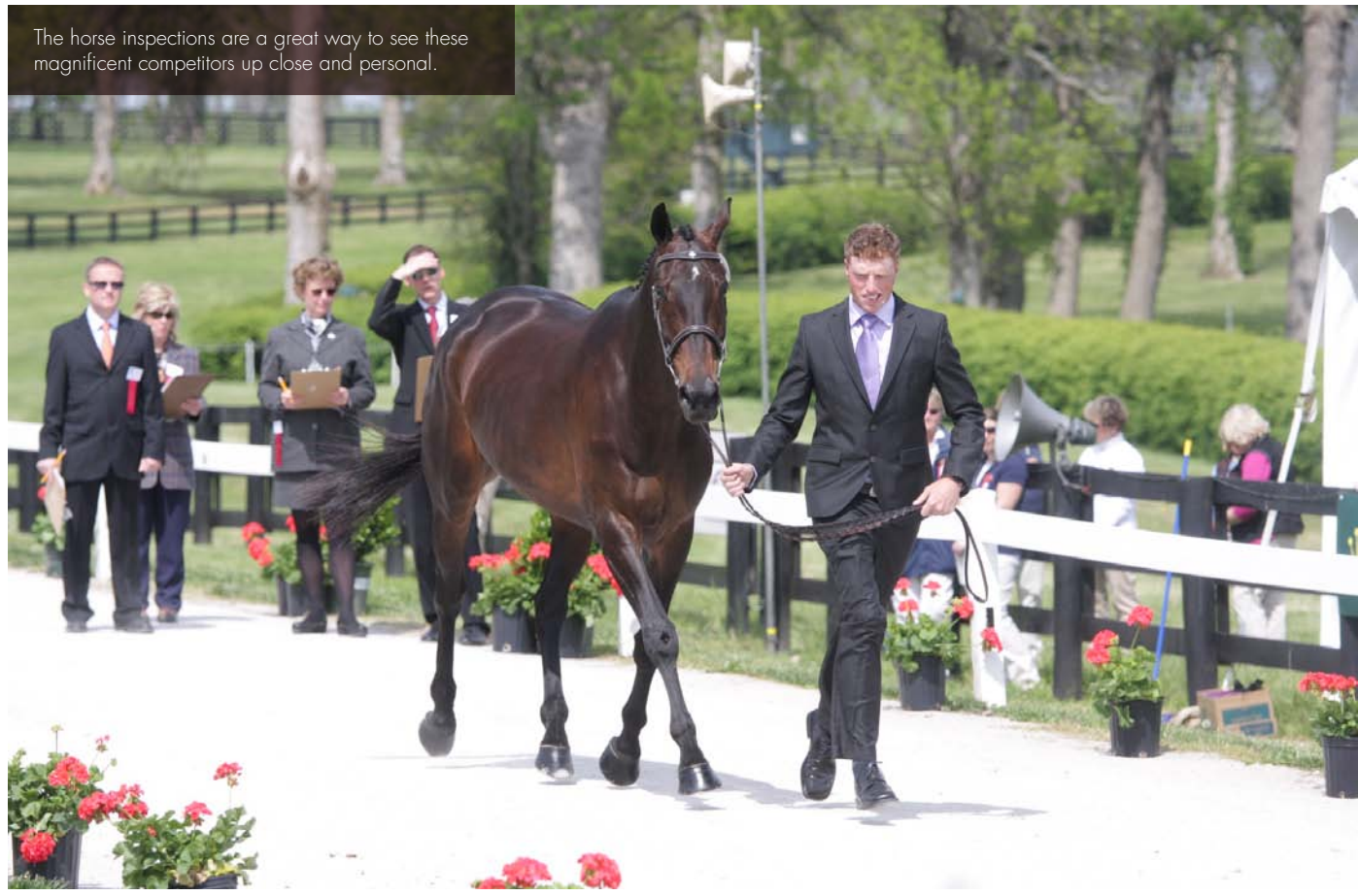
The horse inspections are a great way to see these magnificent competitors up close and personal.