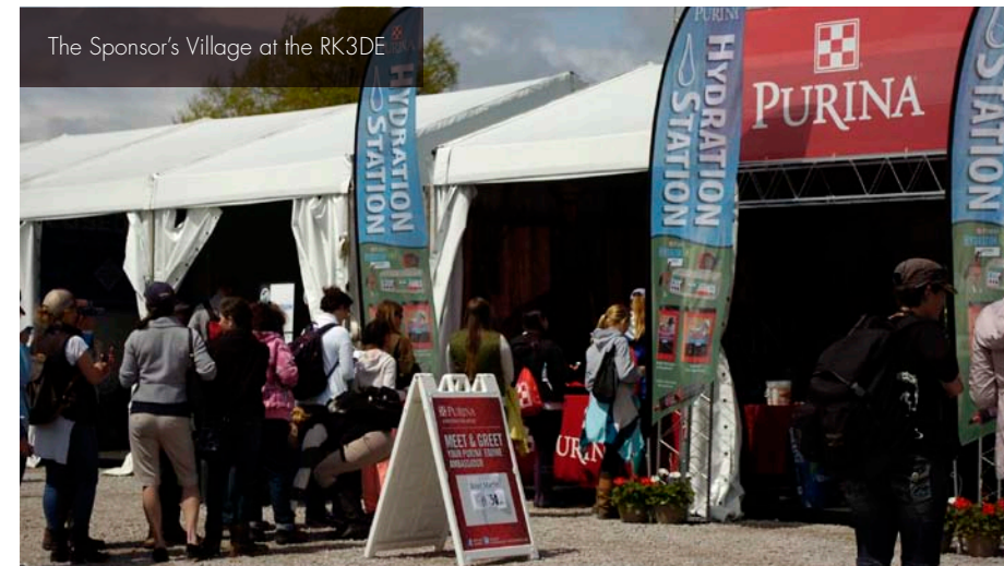
The Sponsor's Village at the RK3DE

For a complete schedule of events, ticket and visitor info, please visit www.rk3de.org