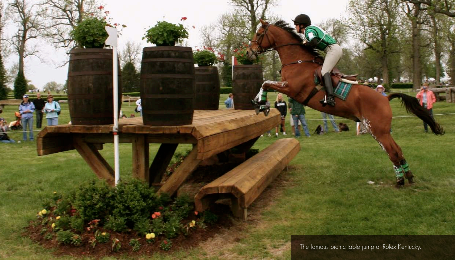
The famous picnic table jump at Rolex Kentucky.

Eventing World Championships at next summer's World Equestrian Games. Interest is sure to be at an all-time high and we recommend that all our fans go on line and order their tickets as soon as they become available!"