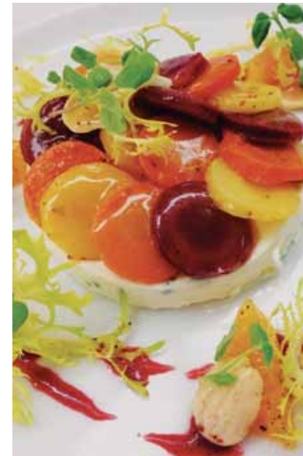
THE FIVE-STAR PENROSE ROOM OFFERS UP EXCEPTIONAL FOOD WITH UNMATCHED SERVICE.

With two water slides, pool-side café and private cabanas, the outdoor "zero entry" infinity pool will be just the place to chill out on a warm Colorado summer