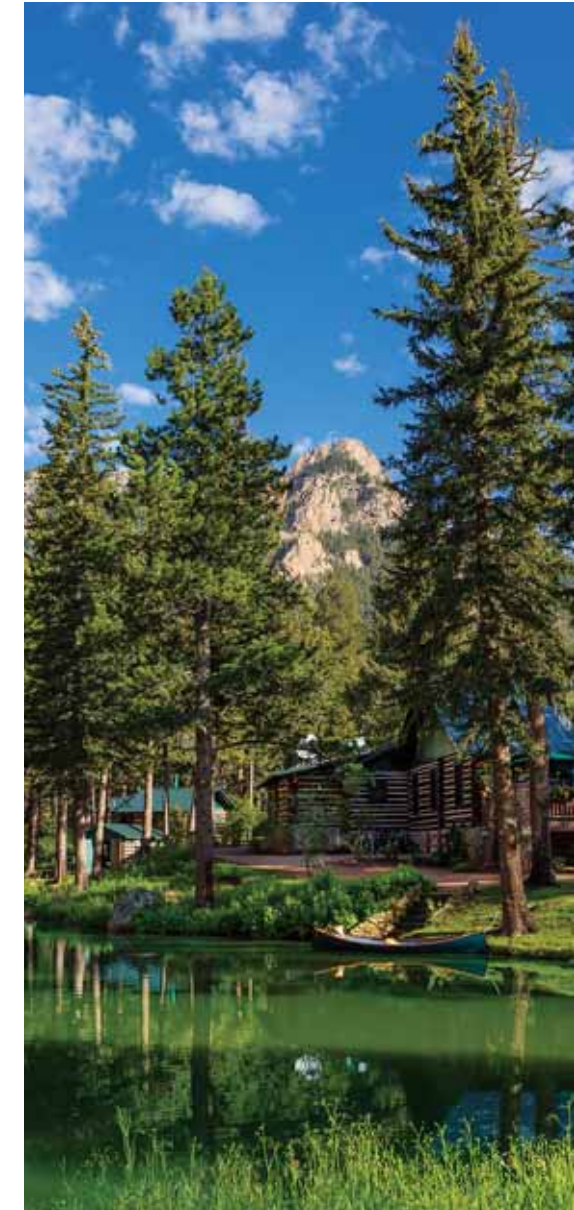
THE RANCH AT EMERALD VALLEY OFFERS A SECLUDED GETAWAY WITH FISHING, HIKING, HORSEBACK RIDING AND LUXURIOUS APPOINTED CABINS.

While staying at The Ranch, you can escape for a day to fly fish in pristine mountain lakes, hike, bike, or ride horses on scenic mountain trails, and then soak away the day's memories in an outdoor hot tub while sipping wine and taking in the beauty of a Colorado sunset. Even though you are away from the hotel itself, the impeccable service, gourmet cuisine,