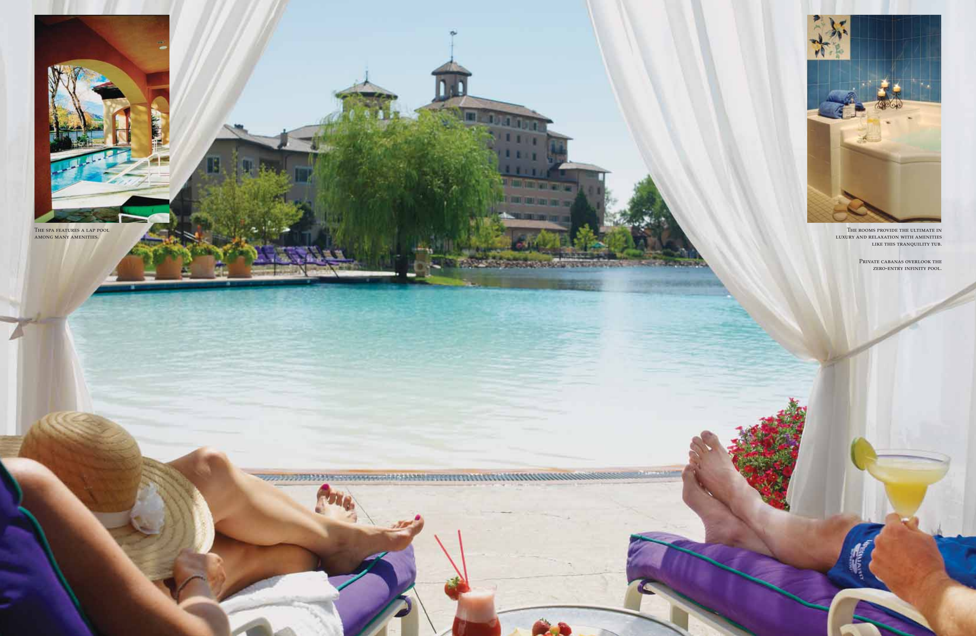
PRIVATE CABANAS OVERLOOK THE ZERO-ENTRY INFINITY POOL.