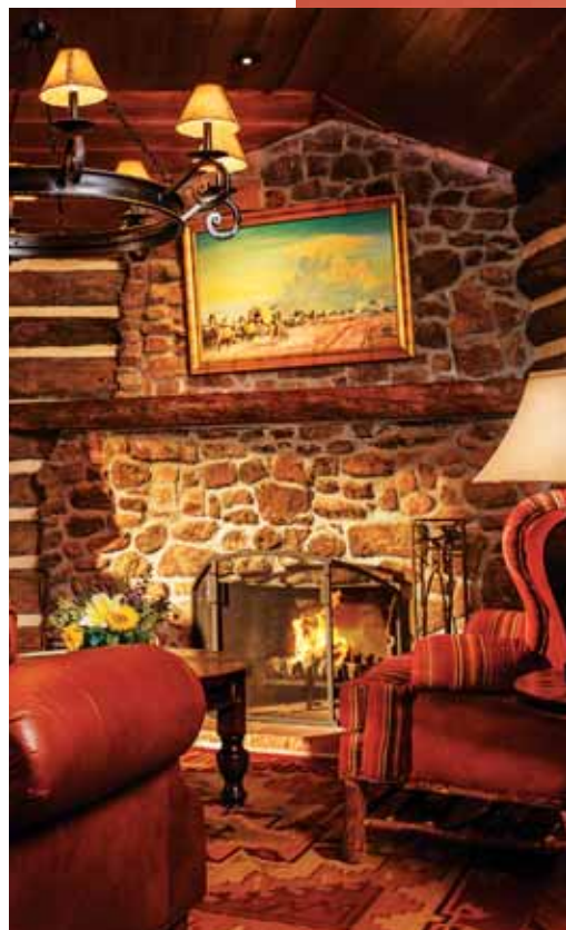
YOU WON'T BE "ROUGHING IT" WHEN YOU STAY AT THE RANCH AT EMERALD VALLEY.

You only live once and most of us who live the equestrian lifestyle live as if every day were our last, so believe me when I tell you that you haven't lived until you ride on into The Broadmoor, and let them pamper you for a few days. Call ahead to 855-541-2673 and they will take care of all the details, so you can relax and enjoy. It will be one of the rare times that you will know what your horse feels like. After all, you give your horse five-star care; now it's your turn.