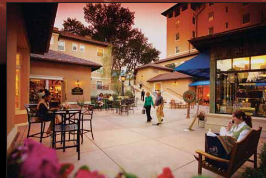
THE 26 HIGH-END RETAIL SHOPS MAKE FOR ONE GLORIOUS SHOPPING TRIP.