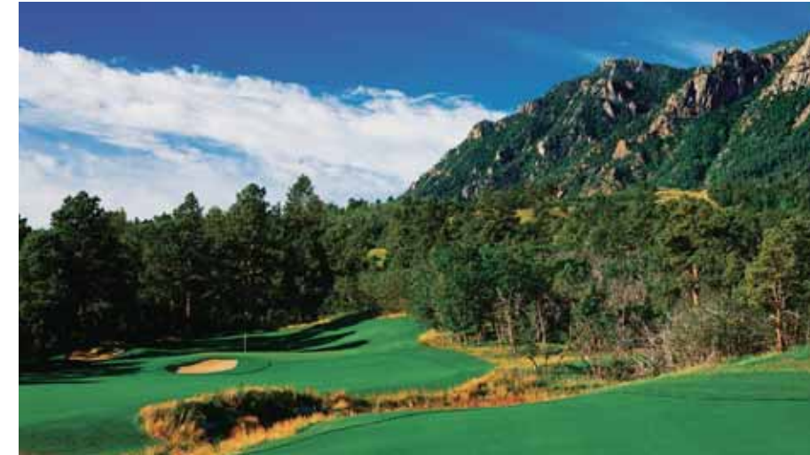
THE BROADMOOR'S MOUNTAIN COURSE IS JUST ONE OF THREE HIGHLY ACCLAIMED CHAMPIONSHIP COURSES THAT ONE CAN PLAY AT THE BROADMOOR.

sites off the hotel grounds, a fly fishing school on the main property, a new entertainment center already completed and improvements to the Golden Bee and The Tavern restaurants. Broadmoor West just opened after a seven-month $57 million renovation that added three floors, increased the number of rooms and dramatically changed the building's appearance. And that's just for starters.