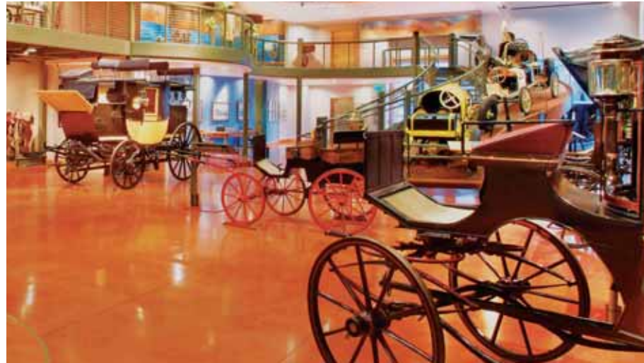
THE PENROSE HERITAGE MUSEUM, ON THE GROUNDS OF THE HOTEL, FEATURES 31 VINTAGE HORSE-DRAWN CARRIAGES.

Also on the grounds of the hotel is the Penrose Heritage Museum featuring 31 historic horse-drawn carriages as well as the Pikes Peak Hill Climb wing, housing historic and modern cars from this iconic event. Now, with the addition of the new wilderness retreats that embrace the outdoor life that we love so much, this is an equestrian lifestyle Disneyland that will amaze, inspire and rejuvenate your spirit like no other resort, ever!