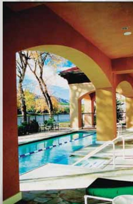
THE SPA FEATURES A LAP POOL AMONG MANY AMENITIES.