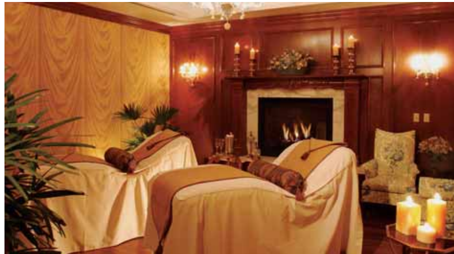
THIS COUPLES MASSAGE ROOM IS ONE EXAMPLE OF WHY THE BROADMOOR SPA IS RATED FIVE-STARS.

Opening late summer of 2014, the Cloud Camp, on the historic site of founder Spencer Penrose's Cheyenne Lodge, offers a 360-degree view of Colorado mountain splendor. A perfect place for group retreats and leisure getaways, the camp's 8,000 sq. ft. lodge