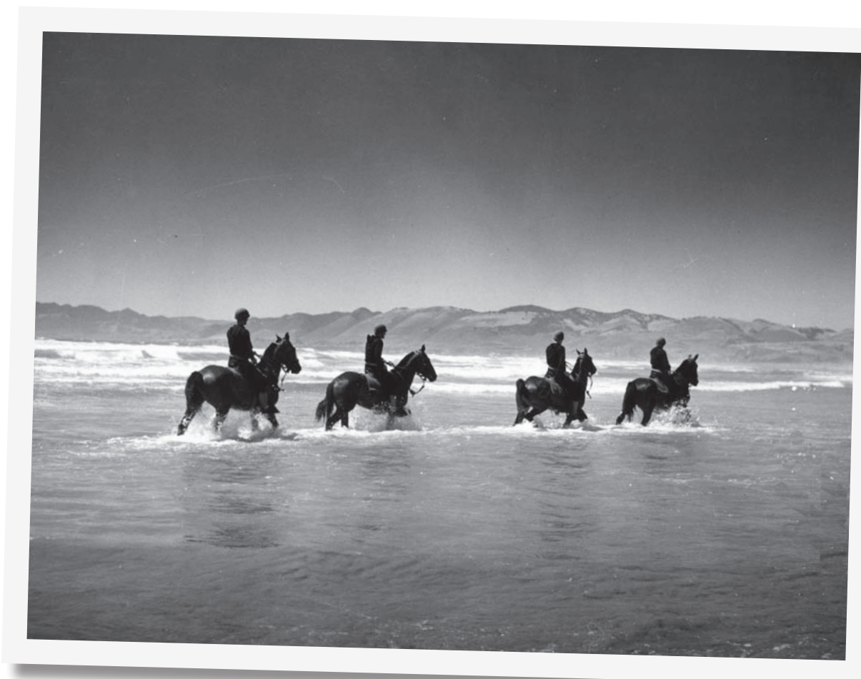
Members of the Coast Guard's Mounted Beach Patrol cross an inlet during their patrol on the West Coast. The use of horses allowed Coast Guard personnel to cover wide stretches of beach more quickly than on foot.